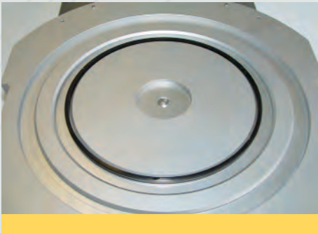
Base support with smaller grip ring