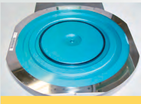
Grip rings pressed together, foil expanded

The POWATEC Expansion Tool allows the expansion of the foil after dicing. The larger diameter grip ring is placed in the upper support of the Expansion Tool. The smaller grip ring is placed in the base support of the Expansion Tool. Between the two supports the diced wafer on the film frame will be placed on the base plate. Thereafter the grip rings are pressed together, which in turn expand the foil. The larger gap between the dies makes it easier to pick of the die from the sticky foil.